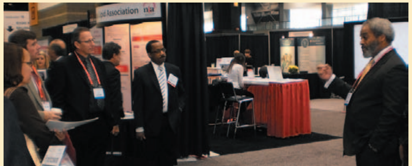
John M. Flack, MD, MPH discusses the new treatment algorithm for managing hypertension in Blacks at the ISHIB exhibit during 2010 AHA meetings.

a web-based application for handheld devices and as a pocket card for a quick reference guide. ISHIB also provided copies of the Consensus Statement (both PDF files on thumb drives and print copies) as it appeared in Hypertension in early November ( Hypertension . 2010;56:780). The interactive algorithm will be available on the ISHIB website in December. Watch for it!